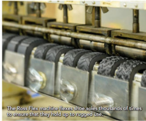
The Ross Flex machine flexes shoe soles thousands of times to ensure that they hold up to rugged use.